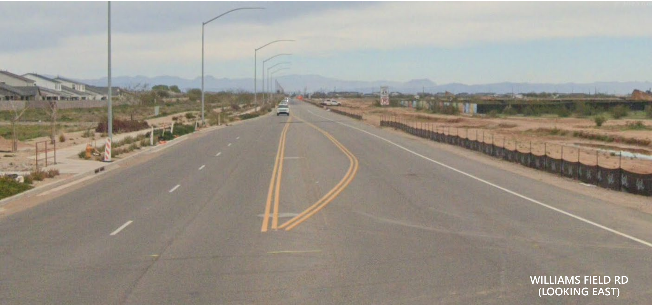
WILLIAMS FIELD RD (LOOKING EAST)