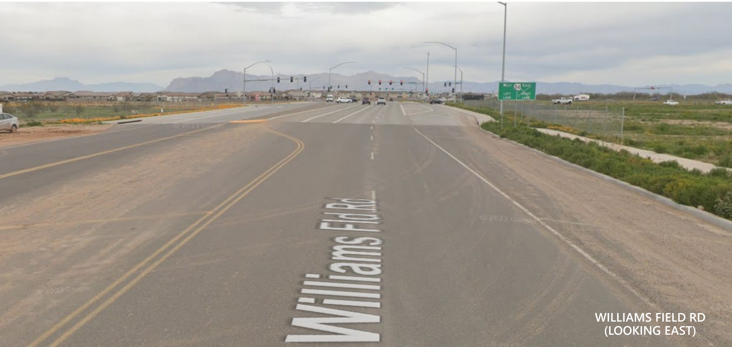
WILLIAMS FIELD RD (LOOKING EAST)