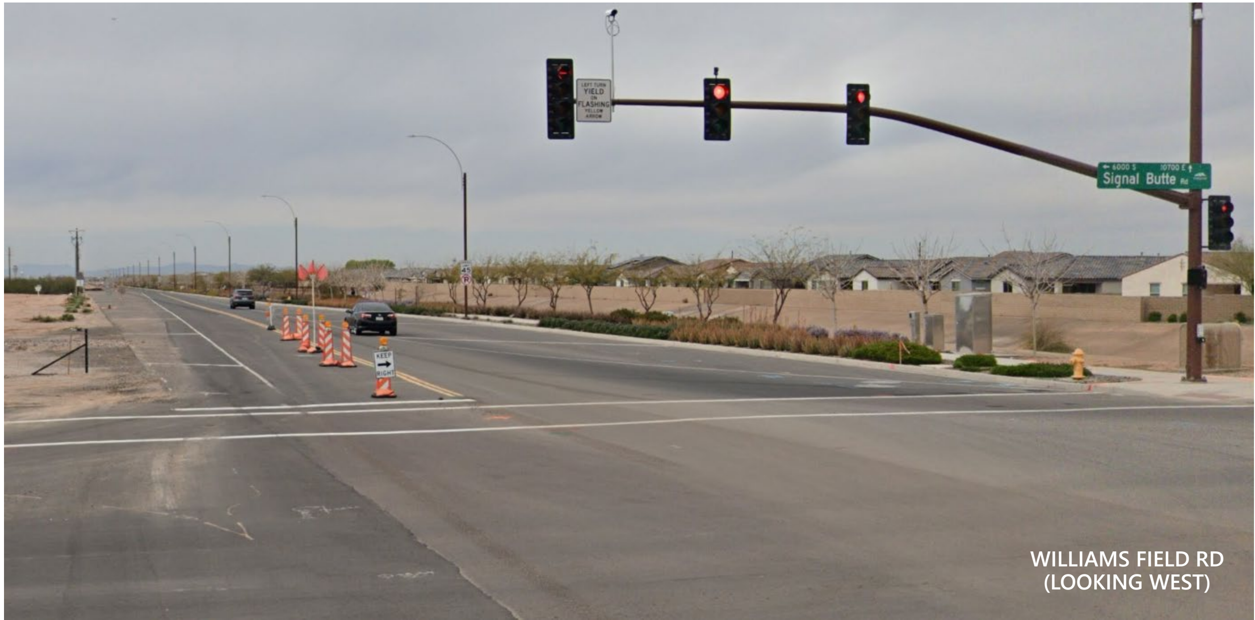
WILLIAMS FIELD RD (LOOKING WEST)